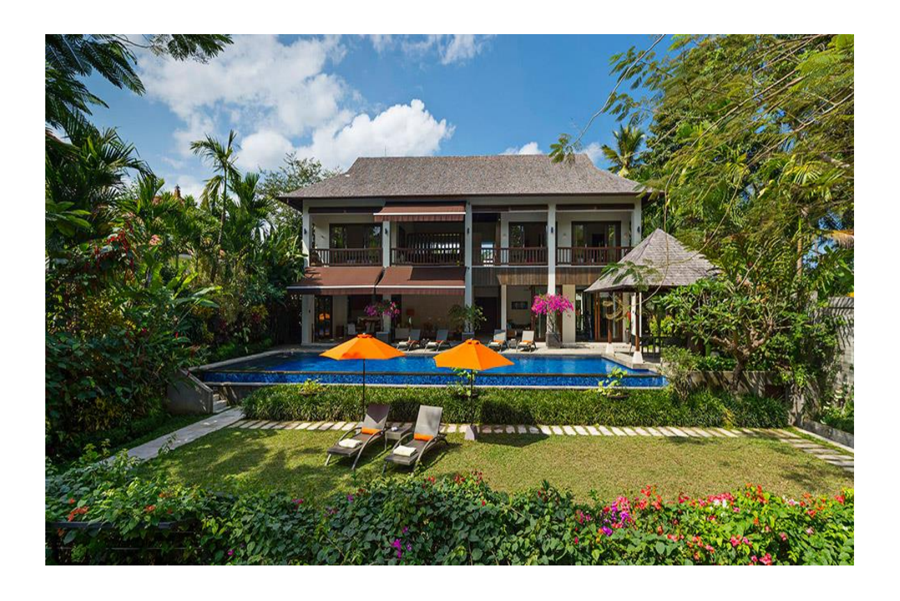
4 Bedroom Villa Ubud, Bali, Indonesia