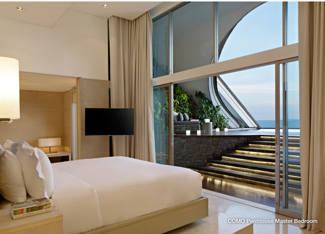
COMO Penthouse Master Bedroom