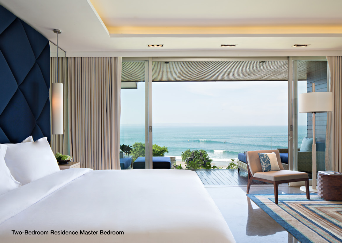
Two-Bedroom Residence Master Bedroom