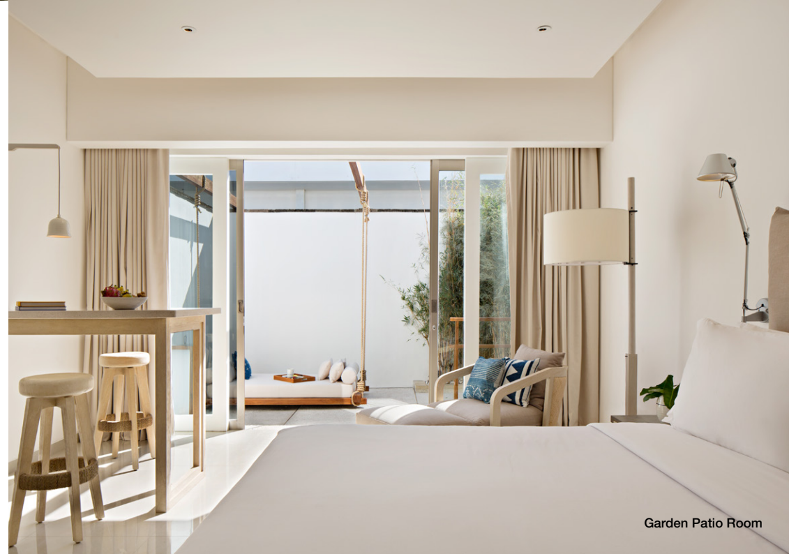
Garden Patio Room

1 Batu Mejan Suite (117sq m): This sprawling suite offers a master bedroom, a spacious living room and a studio area, with room for an additional bed. There is also a large closet space for storage. The interior design employs soft shades of white to create a calming atmosphere, complemented by Indian Ocean views. The large living room and dining area also provide an elegant space for entertaining.