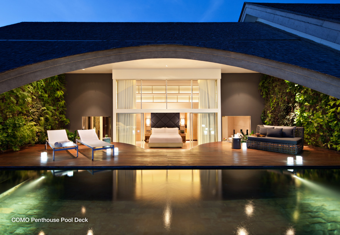
COMO Penthouse Pool Deck