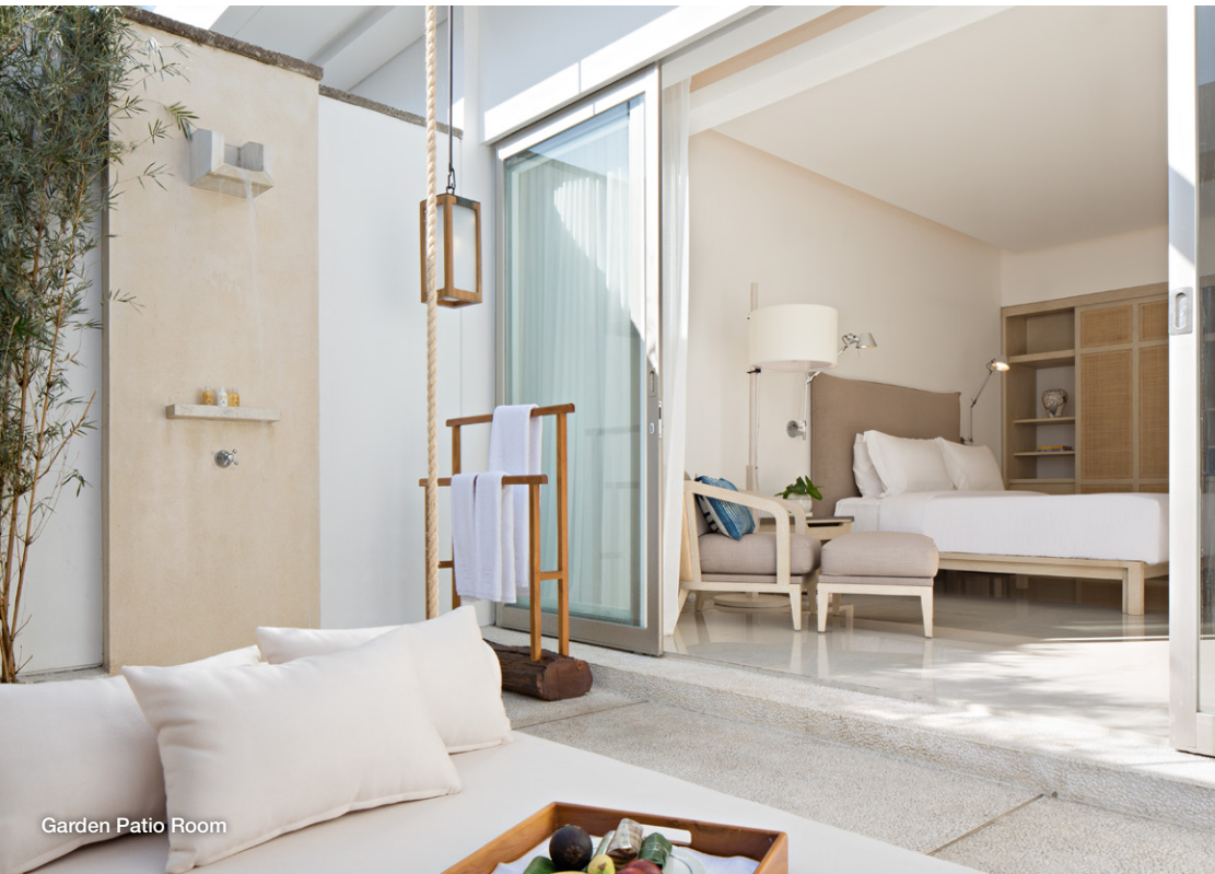
Garden Patio Room