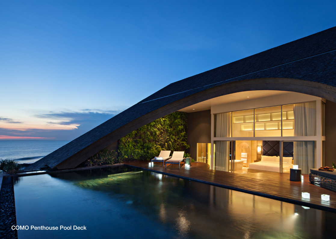
COMO Penthouse Pool Deck